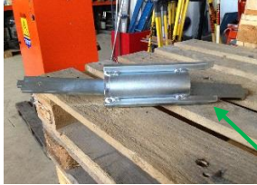
Mixing shaft cleaning tool

Open top of mixing bin again. Remove mixing blade and replace with cleaning tool. Close top, turn RED start button, Push GREEN power button, turn pump motor on and run machine a few seconds to clean inside of tube. Make sure water is on. Open top of bin and check to see if clean. If not repeat process again. If you open the mixing bin you must Turn RED start button again and push GREEN power button to activate controls.