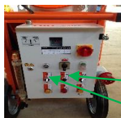
Pump motor switch / Speed switch

Adjust speed switch to desired speed. Dry mix MUST be above "5" speed or water will shut off. Normally a good starting speed is "8 - 9". If using a pre-mixed wet material then under "5" speed is ok. Turn on pump motor switch to the right. Check mortar mixture in bucket. Adjust water volume SLOWLY to get desired consistency. When consistency is correct turn off pump motor. Mixture is ready. Remember it's a good idea to start a little too wet then adjust water volume down after you start spraying. If you adjust speed later in the day you will need to adjust water volume as well or mixture will change consistency.