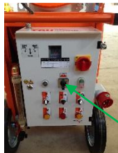
Compressor on switch

Turn on compressor switch on the RITMO XL