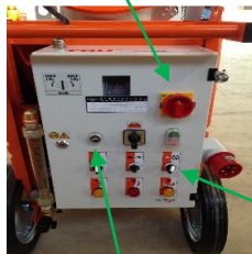
Water on/off switch

Turn on RED main power switch on the RITMO XL. Push GREEN power button. Must do this every time you turn it off.