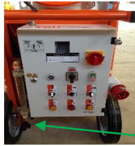
Water volume adjuster knob

Turn water on/off switch to the ON position (left). Push the manual water button on control panel while at the same time adjusting water volume to desired level. If not sure starting level REMEMBER STARTING WETTER IS MUCH BETTER THAN TOO DRY . When desired level is reached release button, let water drain out of the lower water connector. When water stops coming out replace cap.