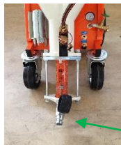
Rotor Stator nozzle

Check mortar bin to make sure it is still dry. Add 1 bag of DRY mix. Make sure you empty the bag in nice and slowly. Put a bucket in front of ROTOR STATOR nozzle to catch the mixed mortar.