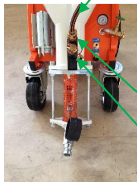
Top water connector

Connect water hose coming from Volume measuring tube to TOP water connector on mixing tube.