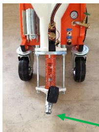
Water should stop coming out here

Turn off water on RITMO XL. Turn on main RED power switch, push GREEN power button. Turn on pump motor and run machine for a few seconds draining all water out of machine. When water stops coming out the Rotor/Stator then shut off. DO NOT RUN TOO LONG WITH NO WATER IT WILL BURN UP THE ROTOR/STATOR!