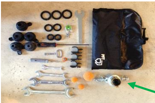
Special hose adapter

Insert 2 small orange cleaning balls into end of mortar hose. Connect mortar hose to water outlet on RITMO XL with special hose adapter. Turn on water until small balls come out other end of hose. Do it two times. Hose is now clean. Clean outside of mortar hose.