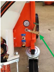
RITMO XL water outlet