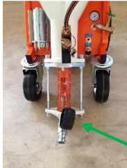
Mortar hose pressure gage

Check pressure in mortar hose. Pressure should be zero. If pressure is not zero then run machine in reverse for a few seconds until pressure is zero. When pressure is zero disconnect mortar hose.